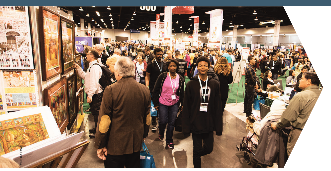
The exhibit hall at the 2017 Religious Education Conference.