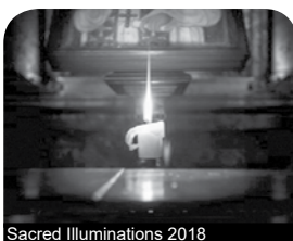
Sacred Illuminations 2018