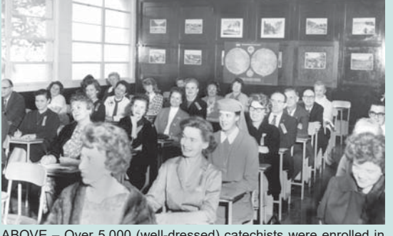
ABOVE - Over 5,000 (well-dressed) catechists were enrolled in the 1963 CCD Institute held at Immaculate Heart College in Los the 1974 Congress, with the theme "Jesus, Others, You."

Focusing on Amoris Laetitia, Pope Francis' Apostolic Exhortation, this workshop will discuss the liturgicospiritual development of the sacrament of marriage and will show how God's grace, flowing from the liturgical celebration, continues to enhance the trust and call to holiness in marriage and family life.