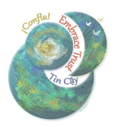
Sower, Seed and Soil