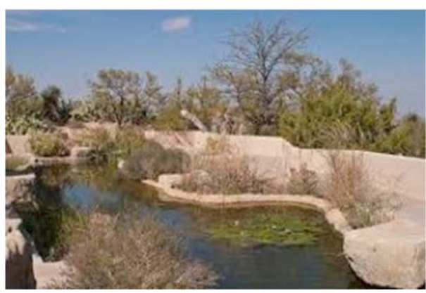
Discovering the Living Desert and Creator Spirit St. Andrew's Abbey Summer Sacred Dance Workshop July 20-23

A $10.00 non-refundable deposit to register. $45 with lunch and $35 without lunch