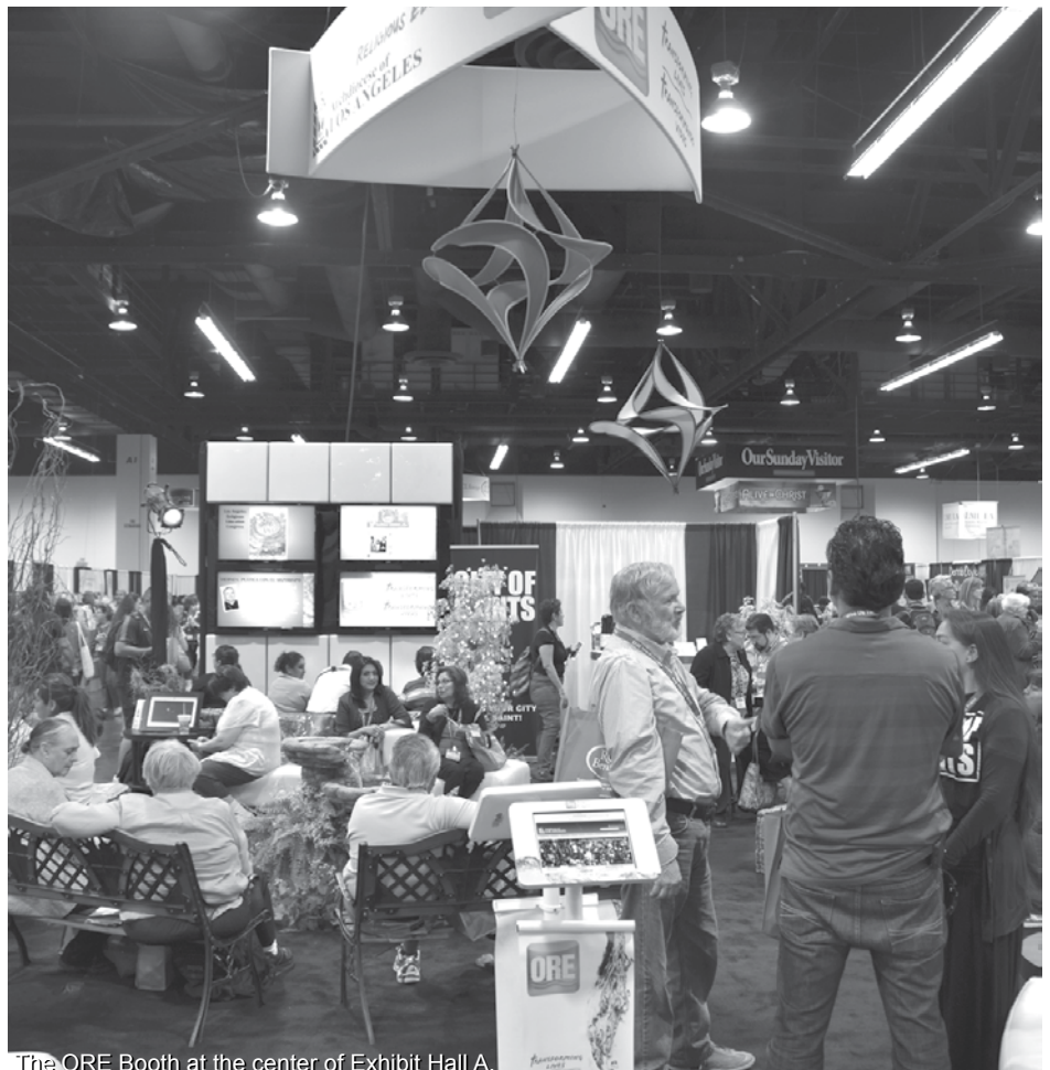
The ORE Booth at the center of Exhibit Hall A.

🎧 and (*) are recorded sessions. Arena sessions in color.