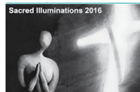
Sacred Illuminations 2016