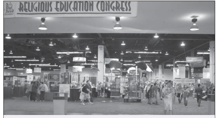
Exhibit Hall A is home to 490 booths housing over 200 companies as exhibitors – ranging from religious art to educational institutions, in addition to our own represented Archdiocesan ministries.

We know the Gospel message is for everybody, but how can we make it more accessible for children and teens with special needs? In this session, we will discuss what our Church teaches about inclusion of persons with disabilities and learn basic skills that catechists and catechetical leaders can use to ensure that everyone can discover the faith.