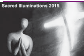
Sacred Illuminations 2015