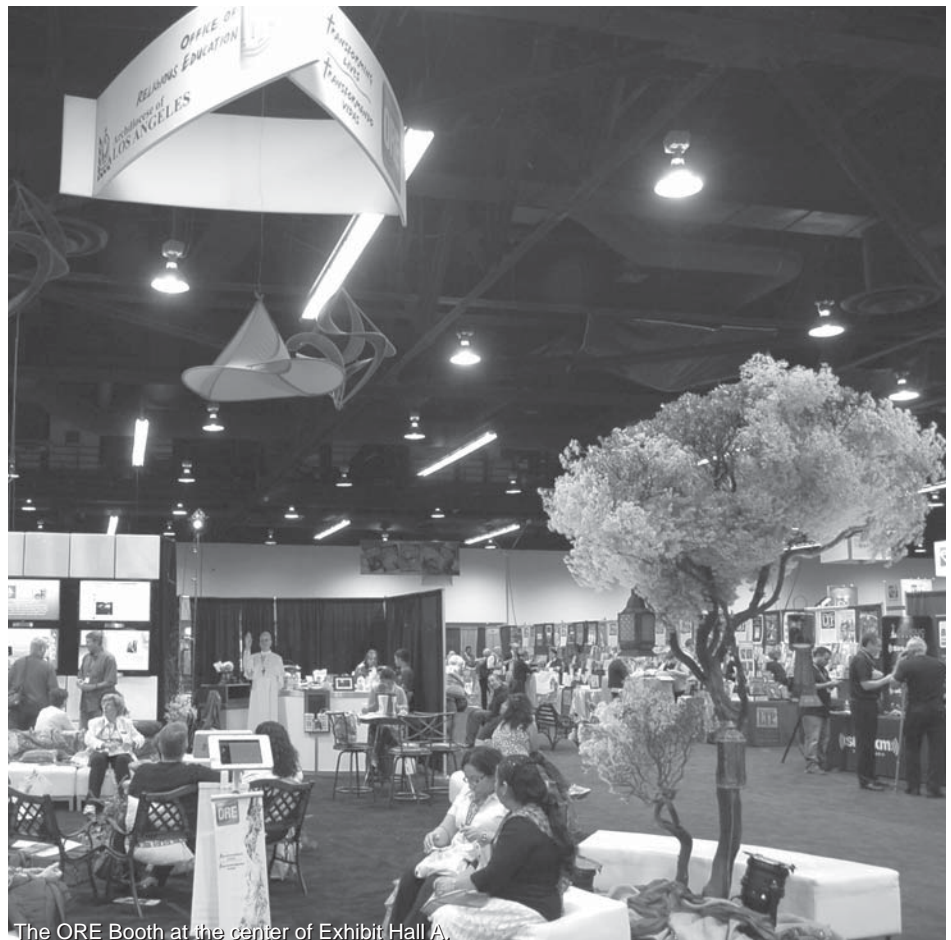
The ORE Booth at the center of Exhibit Hall A.