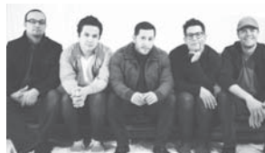
The Jacob & Matthew Band