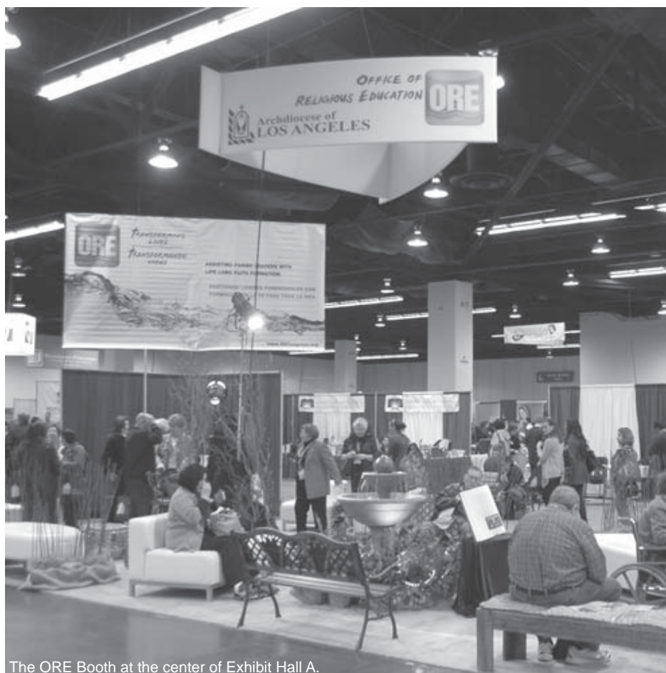
The ORE Booth at the center of Exhibit Hall A.