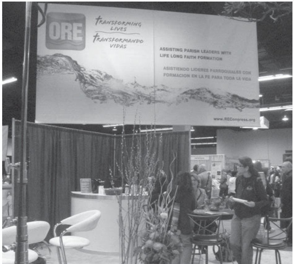
YOU CAN FIND the Office Of Religious Education Booth at the center of Hall A.