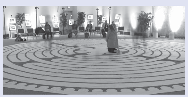
THE LABYRINTH has become a landmark feature of Sacred Space. Tucked away on the third level, Sacred Space offers a respite from the daily buzz of Congress, with music, art and a chapel.