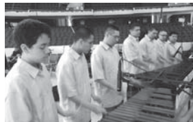
Holy Cross Marimba Ensemble