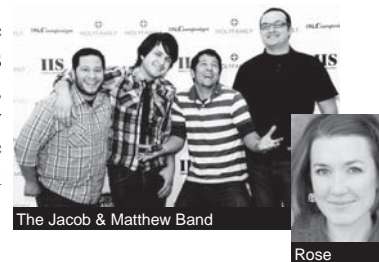
The Jacob & Matthew Band