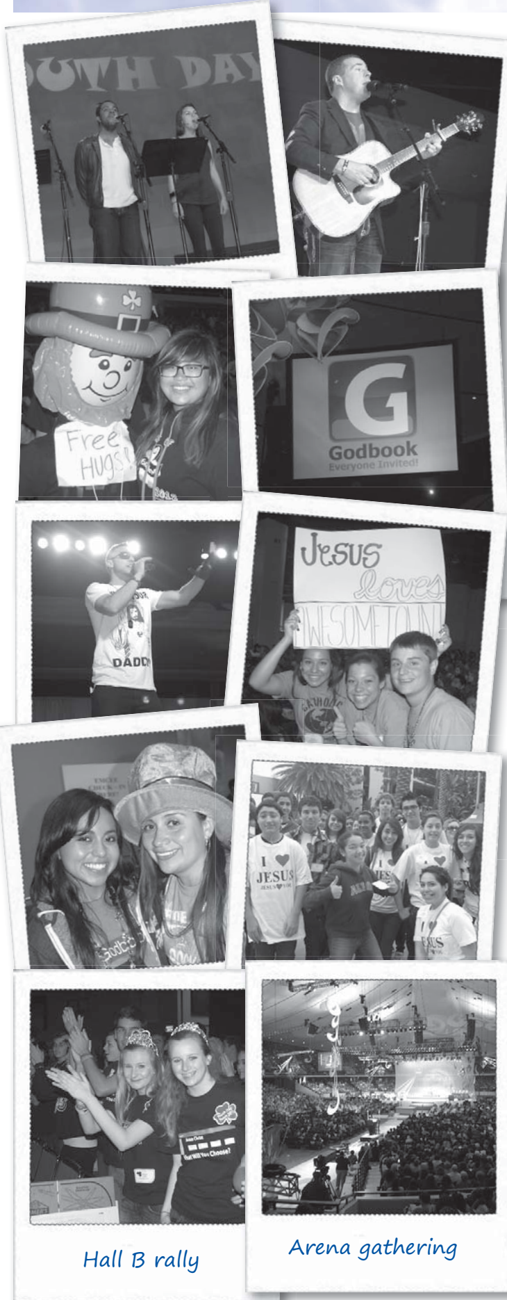
Hall B rally