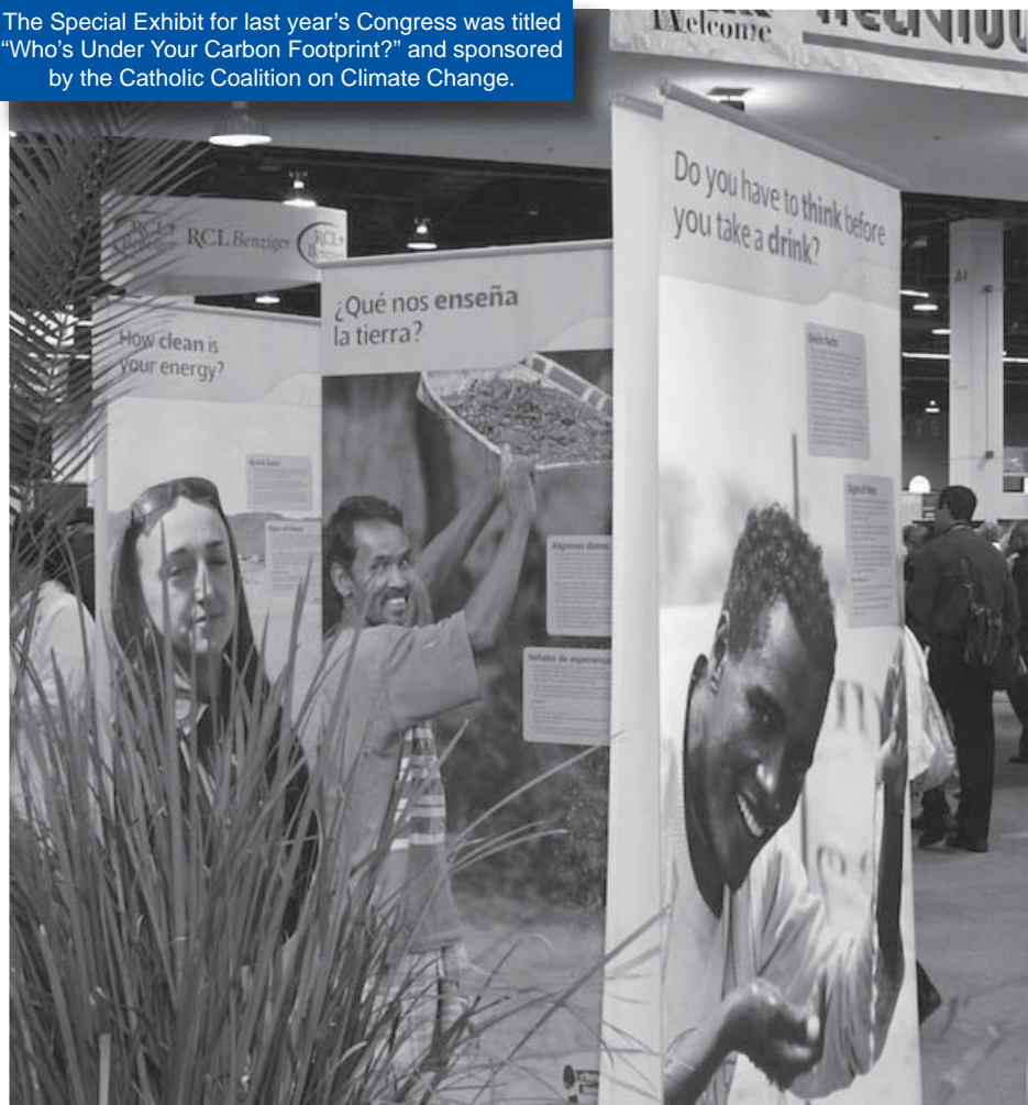
The Special Exhibit for last year's Congress was titled “Who's Under Your Carbon Footprint?” and sponsored by the Catholic Coalition on Climate Change.