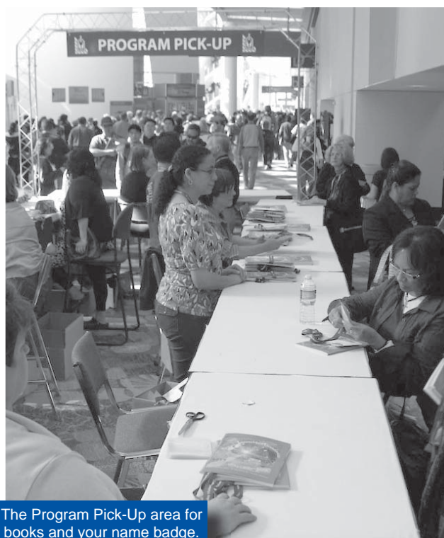
The Program Pick-Up area for books and your name badge.