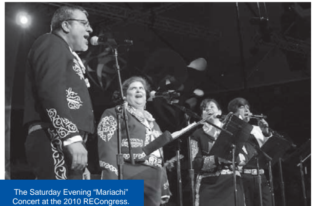
The Saturday Evening "Mariachi" Concert at the 2010 RECongress.