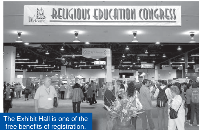
The Exhibit Hall is one of the free benefits of registration.