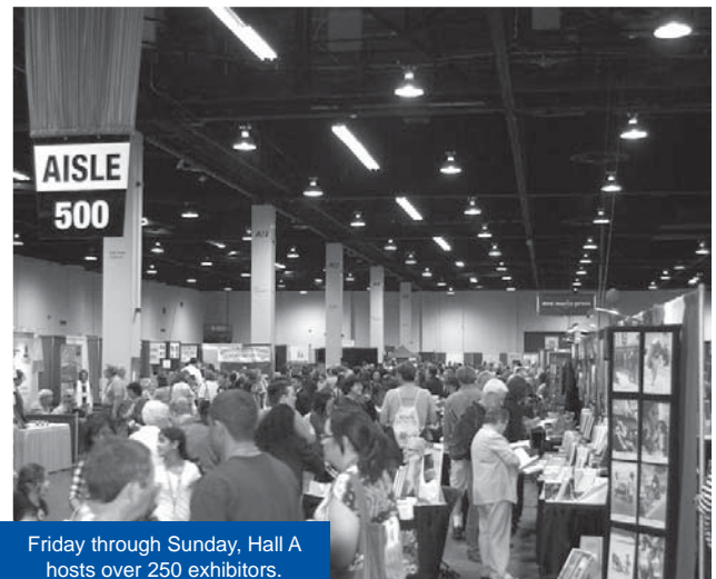
Friday through Sunday, Hall A hosts over 250 exhibitors.