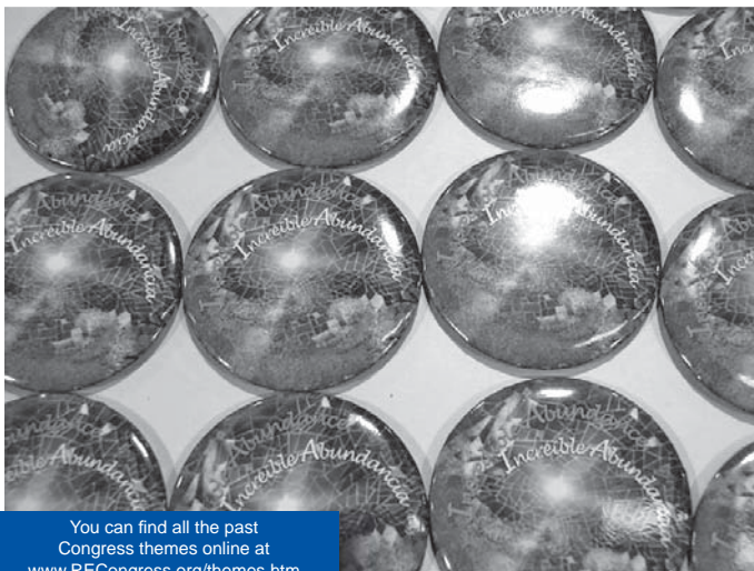
You can find all the past Congress themes online at www.RECongress.org/themes.htm