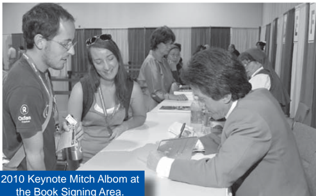
2010 Keynote Mitch Albom at the Book Signing Area.