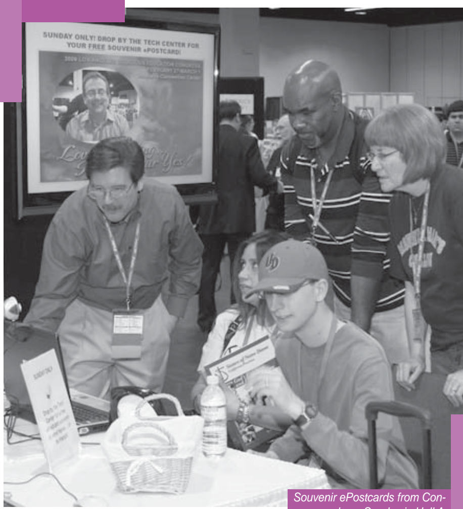
gress only on Sunday in Hall A