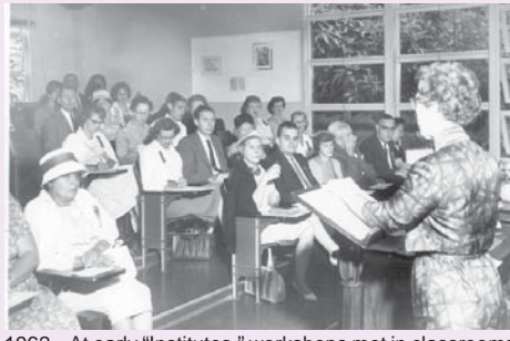
1962 – At early "Institutes," workshops met in classrooms on campus at Immaculate Heart College in Los Angeles.