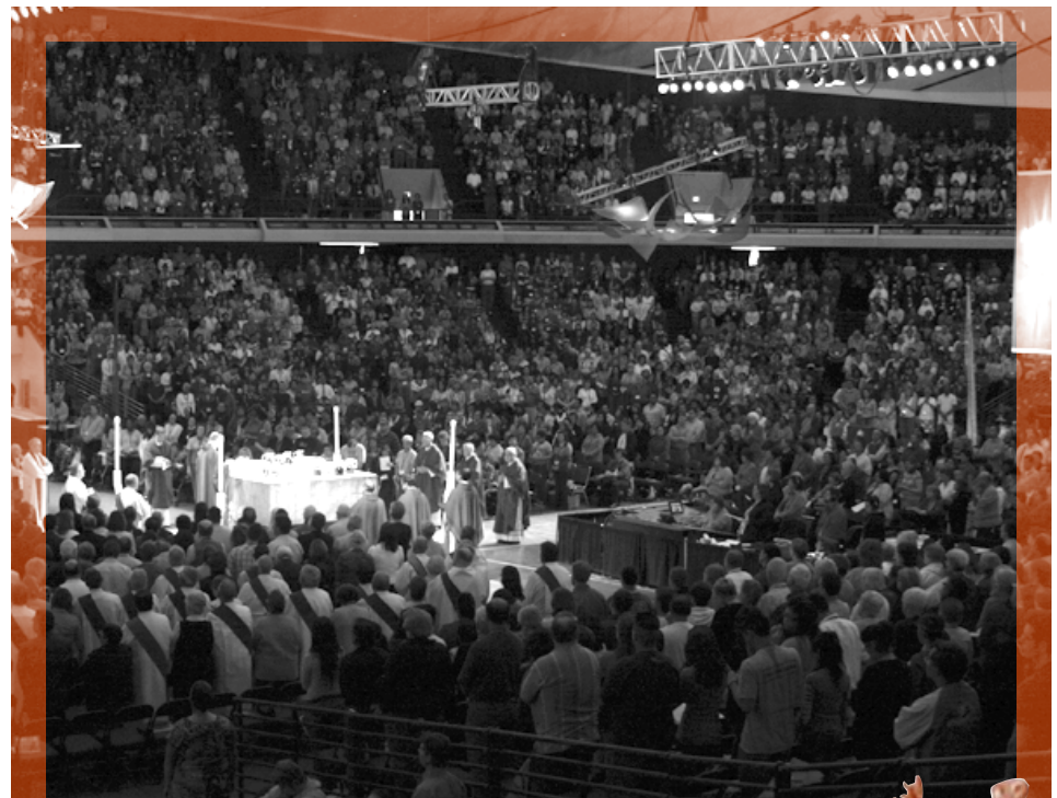
The Anaheim Convention Center Arena – here filled with nearly 8,000 from last year’s Closing Liturgy – is the location for the seven largest Eucharistic liturgies offered throughout the Congress weekend. (There are a total of 14 Eucharistic liturgies in addition to three prayer services).