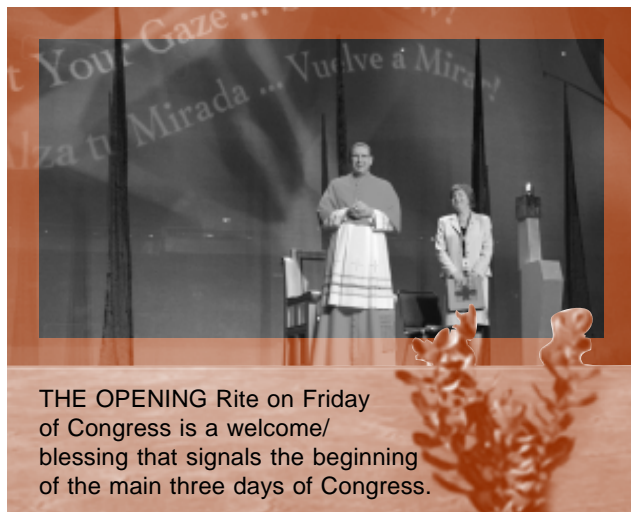
THE OPENING Rite on Friday of Congress is a welcome/ blessing that signals the beginning of the main three days of Congress.