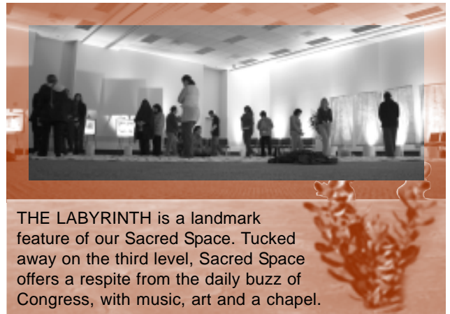
THE LABYRINTH is a landmark feature of our Sacred Space. Tucked away on the third level, Sacred Space offers a respite from the daily buzz of Congress, with music, art and a chapel.