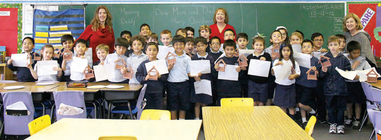
Our Lady of Lourdes School second graders display Nativity scenes they have made for their parents for Christmas.

15 16 17 18 19 20 21 22 23 24 25 26 27 28 29 30 31 52 33 34 35 36 37 38 39 40 41 42 43 44 45 46 47 48 49 50 51 52 53 54 55 56 57 58 59 60 61 62 63 64 65 66 67 68 69 70 71 72 73 74 75 76 77 78 79 80 81 82 83 84 85 86 87 88 89 90 91 92 93