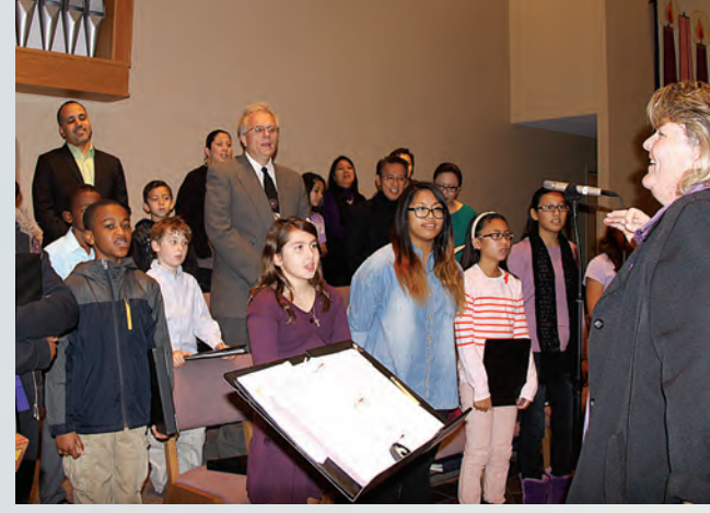
a.m. Family Mass.