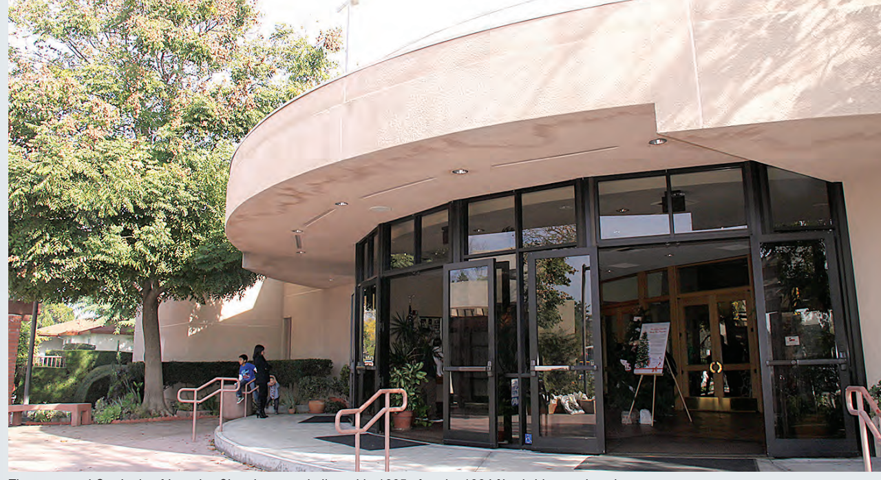
The renovated Our Lady of Lourdes Church was rededicated in 1995 after the 1994 Northridge earthquake.

Established: September 1, 1958 Location: 18405 Superior Street, Northridge San Fernando Region: Deanery 5