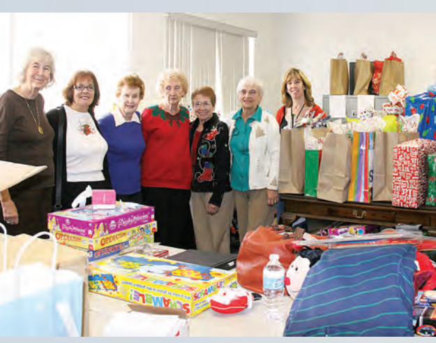
to families through MEND.