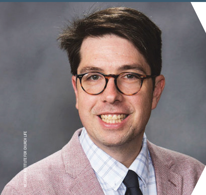
MCGRATH INSTITUTE FOR CHURCH LIFE