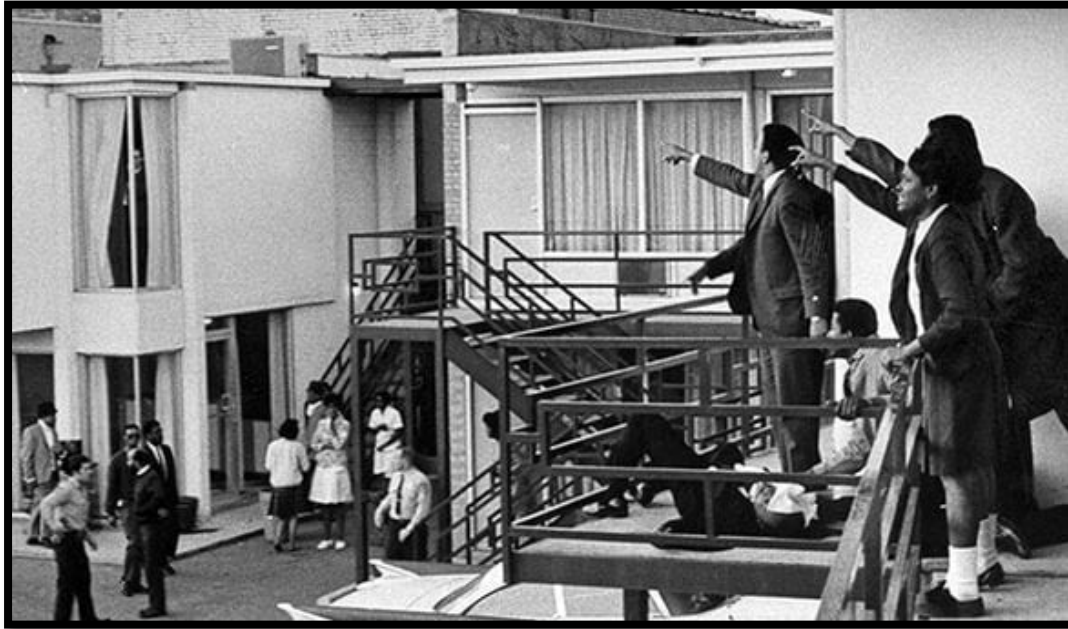
A mortally wounded Dr. King sprawled on the balcony of the Lorraine Motel in Memphis, Tennessee as his aides point in the direction of the gunman.

"Everybody can be great, because everybody can serve. You don't have to have a college degree to serve. You don't have to make your subject and your verb agree to serve. You don't have to know about Plato and Aristotle to serve. You don't have to know Einstein's theory of relativity to serve. You don't have to know the second theory of thermodynamics in physics to serve. You only need a heart full of grace, a soul generated by love. And you can be that servant."