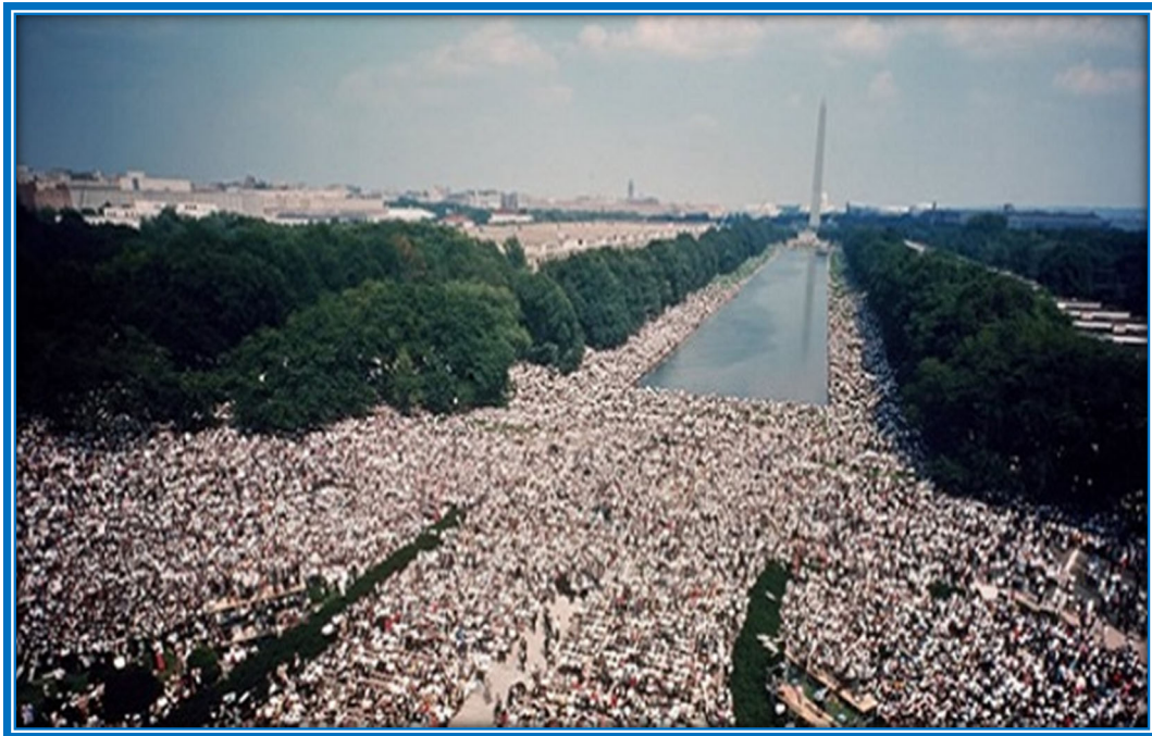
Hundreds of thousands from all over the nation gathered on the National Mall and surround the Lincoln Memorial Reflecting Pool to hear Dr. King’s address, which was a turning point in the Civil Rights Movement.