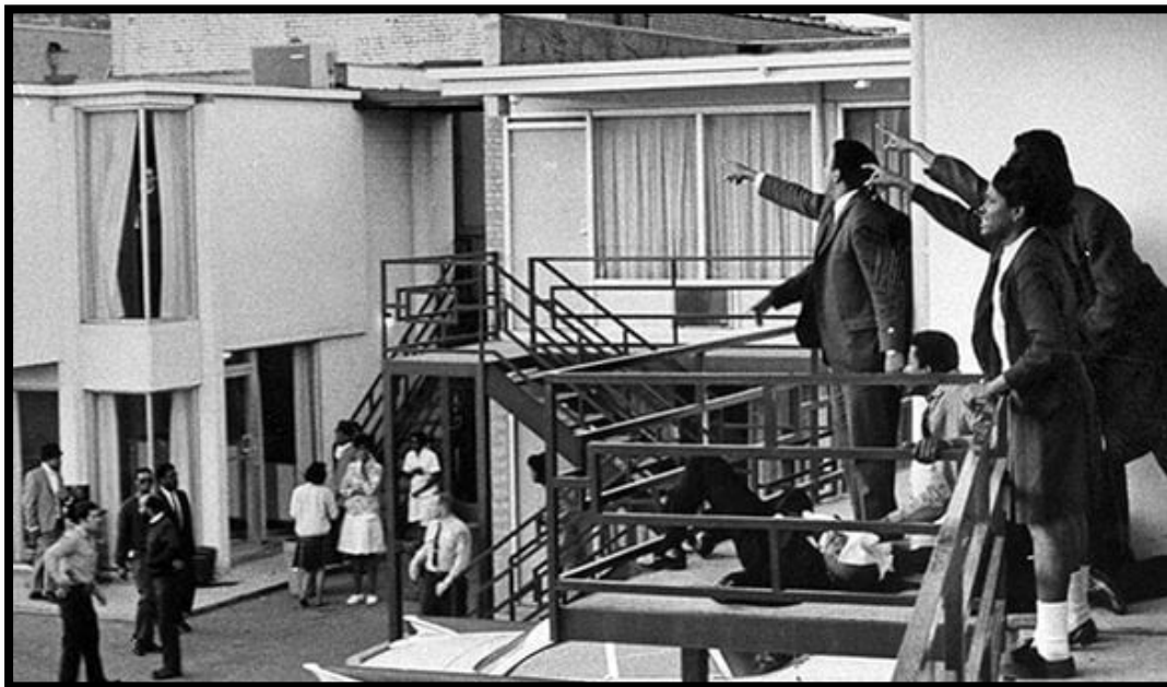
A mortally wounded Dr. King sprawled on the balcony of the Lorraine Motel in Memphis, Tennessee as his aides point in the direction of the gunman.