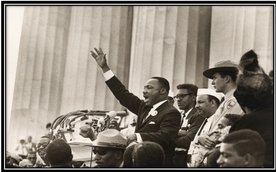
Dr. King delivering his momentous “I Have a Dream” address in front of the columns of the Memorial to Abraham Lincoln, August 28, 1963