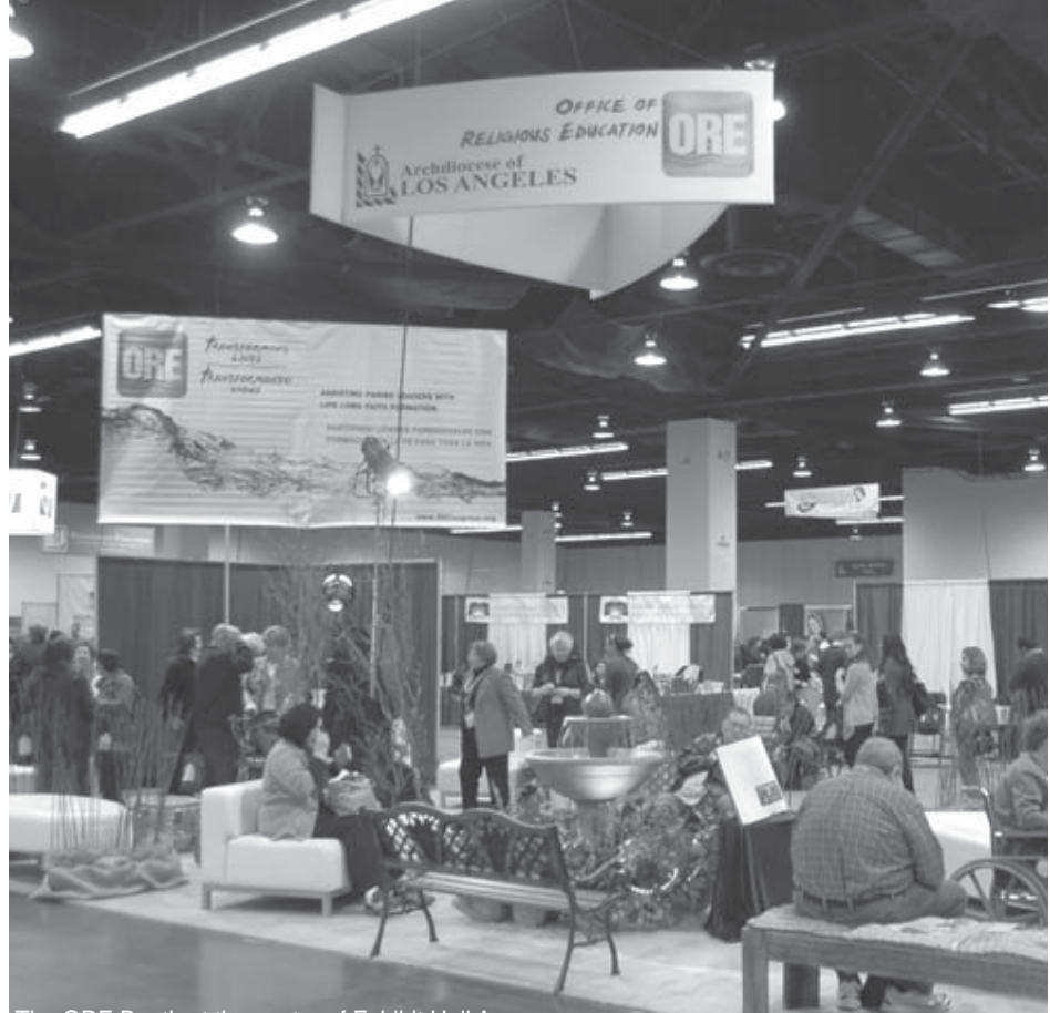
The ORE Booth at the center of Exhibit Hall A.