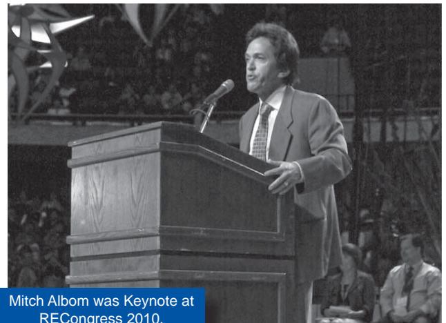
Mitch Albom was Keynote at RECongress 2010.

Wise and deeply joyful, strong and yet very gentle, the great soul Fr. Thomas Berry, CP, died on June 1, 2009 at the age of 94, in the same place in which he was born, Greensboro, N.C., a place he deeply loved and one which nurtured his sense of nature mysticism from the time of his youth. Fr. Berry was a historian of world cultures and religions, who eventually developed into a historian of the Earth and its evolutionary processes, and thus came to describe himself as a “geologist.” This workshop will acquaint listeners with Fr. Berry’s wonderful work and its contribution toward the understanding of the “new scientific story” of the cosmos.