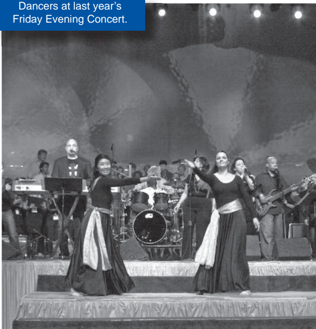
Dancers at last year's Friday Evening Concert.

This workshop explores the many-layered landscape of kindness as it is lived within the hectic terrain of challenging life situations. No matter what kind of circumstances exist, kindness has the ability to alter one's perceptions of self and others and to engage in differences without losing a spirit of compassion. Various approaches to kindness will be presented using sources such as scripture, poetry, spiritual writings and music.