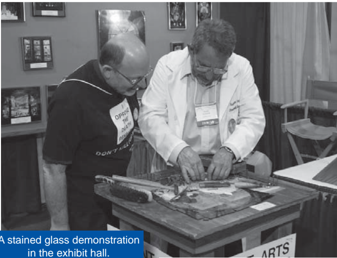
A stained glass demonstration in the exhibit hall.