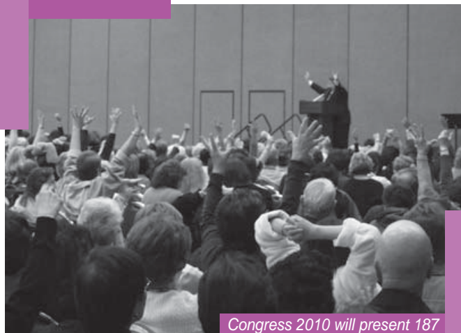
Congress 2010 will present 187 speakers and 305 workshops.

The Catholic Church is learning to harness and embrace new media and social networking technologies to respond to the call for new evangelization. From the Vatican's YouTube channel, to hundreds of Catholic podcasts and applications on iTunes, to thousands of Catholic interest groups on Facebook, today's Catholics are turning to new media for faith formation, fellowship and evangelization. Learn to employ new media technologies in adult catechesis and explore the creative use of podcasting, streaming video and social networking techniques. A brief overview of software options and resources for new media basics will be provided.