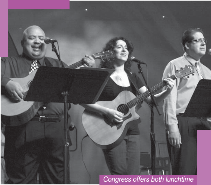
Congress offers both lunchtime and evening concerts.