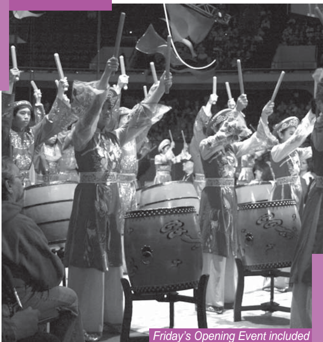
Friday's Opening Event included the Vietnamese Drummers.