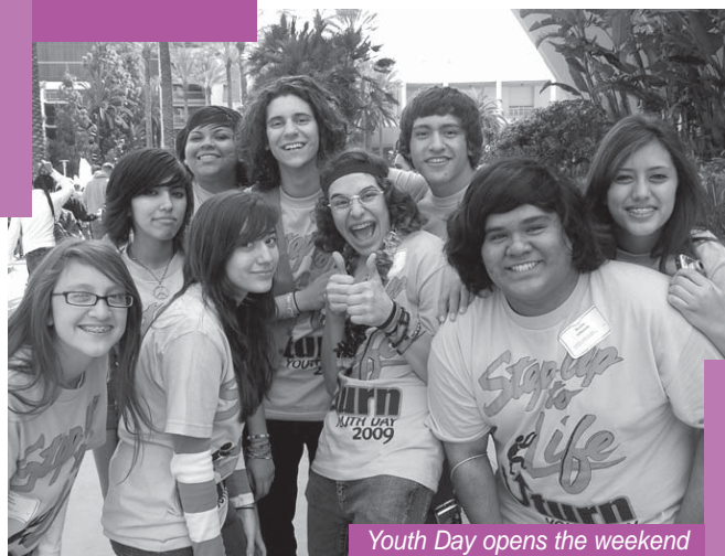
Youth Day opens the weekend with 15,500 in attendance.

There are many proposals for evaluating whether or not a particular liturgy is effective. The “Constitution on the Sacred Liturgy” sets forth a conscious participation full of vibrancy as the goal. Perhaps no worshipping community has accomplished this better than the African-American community – across denominational lines. Its attention to music, preaching, prayer and leadership has made it so. Is there anything that we can still learn from our sisters and brothers in the faith as we continue in the church’s reform and renewal of the liturgy? Yes! Come and garner what an incredible abundance awaits us as we revisit the worship experiences of “black folk.”