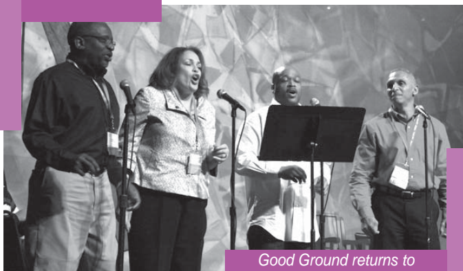
Good Ground returns to perform at Congress 2010.