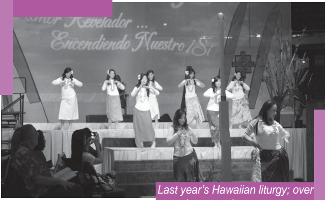
Last year's Hawaiian liturgy, over a dozen to choose among.