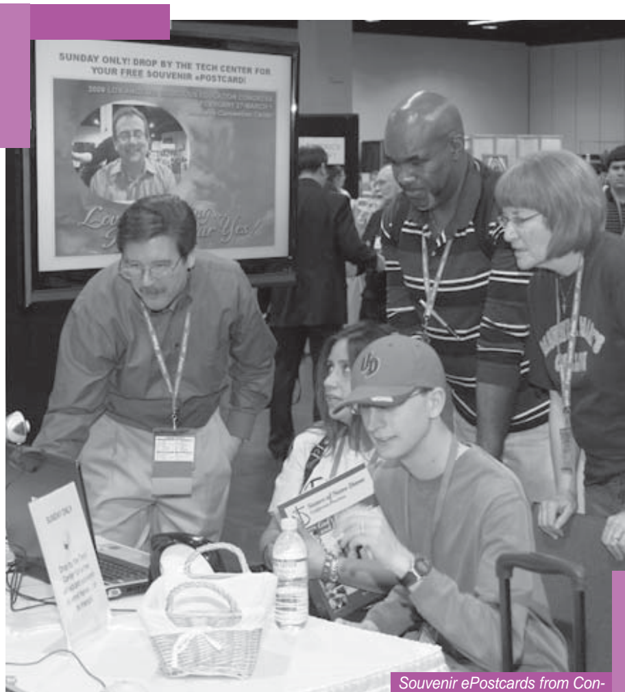
Souvenir ePostcards from Congress only on Sunday in Hall A